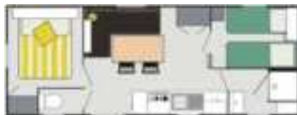
Non contractual plan

All of our cottages are equipped with a spacious and bright living room with dining area that can be converted into a double bed ideal for children for 6 people (except Family Plus Premium). A bedroom with a double bed a bedroom with 2 juxtaposed single beds (pillows and blankets provided, sheets not provided available for rent) a fitted kitchen with gas hob or electric fridge with freezer compartment microwave electric coffee maker and crockery for 4 or 6 people depending on the accommodation heating and water heater bathroom with washbasin and shower separate WC garden furniture and private patio.